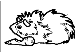
Patch, the reason behind us